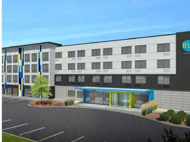
An artist's rendering of the new Hilton Tru hotel to be built in River Ranch is seen.