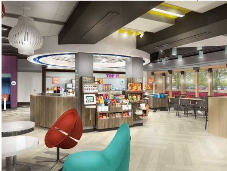
An artist's rendering of the lobby new Hilton Tru hotel to be built in River Ranch is seen.